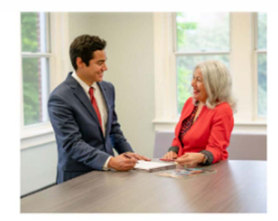
MEET YOUR CAREER COACH